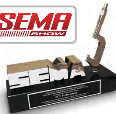
2012 SEMA BEST NEW PERFORMANCE PRODUCT AWARD WINNER