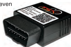
iTSX / TSX for Android Wireless OBD-II Interface

From the factory, your vehicle's computer is calibrated for the masses, designed with the average driver in mind, not the performance enthusiast. This not only leaves valuable Horsepower & Torque hidden inside your vehicle, but it also makes for a mediocre driving experience. The iTSX / TSX For Android™ System unlocks your vehicle's hidden performance potential by wirelessly re-calibrating your vehicle's computer for Maximum Horsepower & Torque, Increased Throttle Response, Firmer Shifts & even Increased Fuel Mileage.