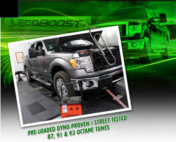
PRE-LOADED DYNO PROVEN / STREET TESTED 87, 91 & 93 OCTANE TUNES